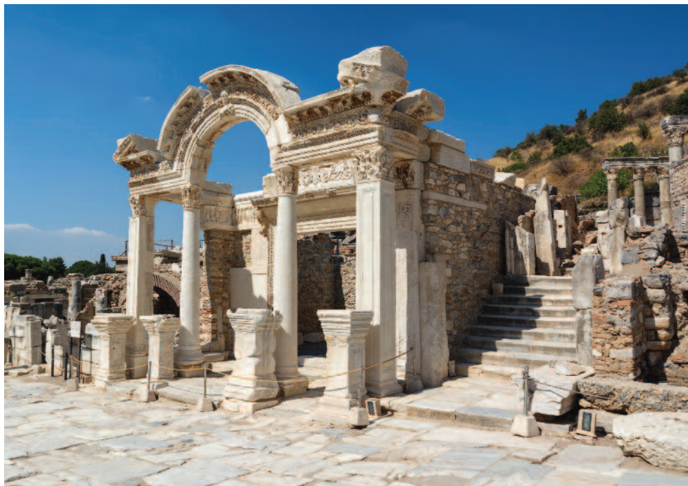
Temple of Hadrian, Ephesus