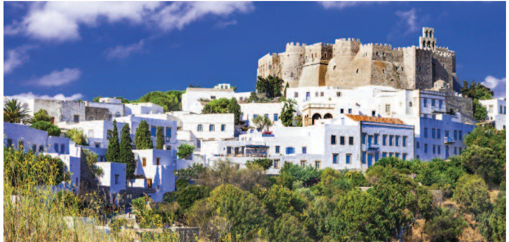
The Monastery of St. John the Divine in Patmos dominates the town of Chora