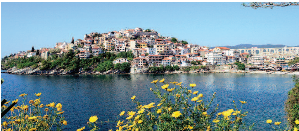
Kavala, the ancient port town of Neapolis where St. Paul landed in AD 49.