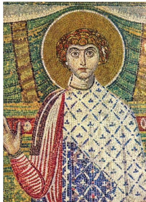
Mosaic of St. Demetrios, Thessaloniki