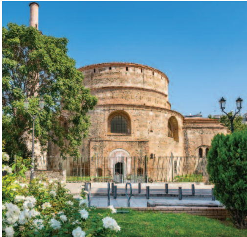
Rotunda of Galerius, Thessaloniki

Thalassa Journeys was established by the principals and managers of Travel Dynamics, the company that 50 years ago pioneered the concept of educational travel for America's educational and cultural institutions. The belief that travel is primarily a learning experience forms the core principle of Thalassa Journeys. We bring an unrivaled depth of experience to make your journey with us meaningful, unique and seamless. We will take you not only to marvelous places, but we will also bridge the past with the present, illuminate the ancient sites we explore – what they were, how they came to be, and why they matter to us – make them come alive, and enrich your mind and inspire your senses. We are steeped in the culture of our destinations and know the secret places often overlooked by the guidebooks. We welcome you to the ever fascinating world of Thalassa Journeys.