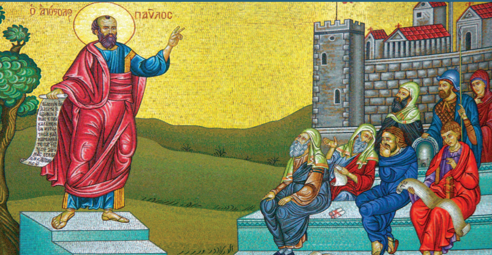
Mosaic depicting St. Paul preaching

FOR RESERVATIONS AND INFORMATION PLEASE CALL TOLL-FREE 866-633-3611