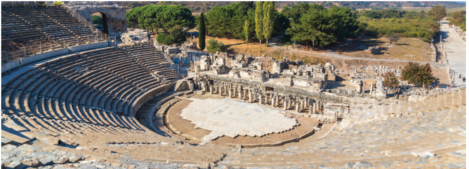
The ancient theater of Ephesus where the Ephesians rioted against St. Paul