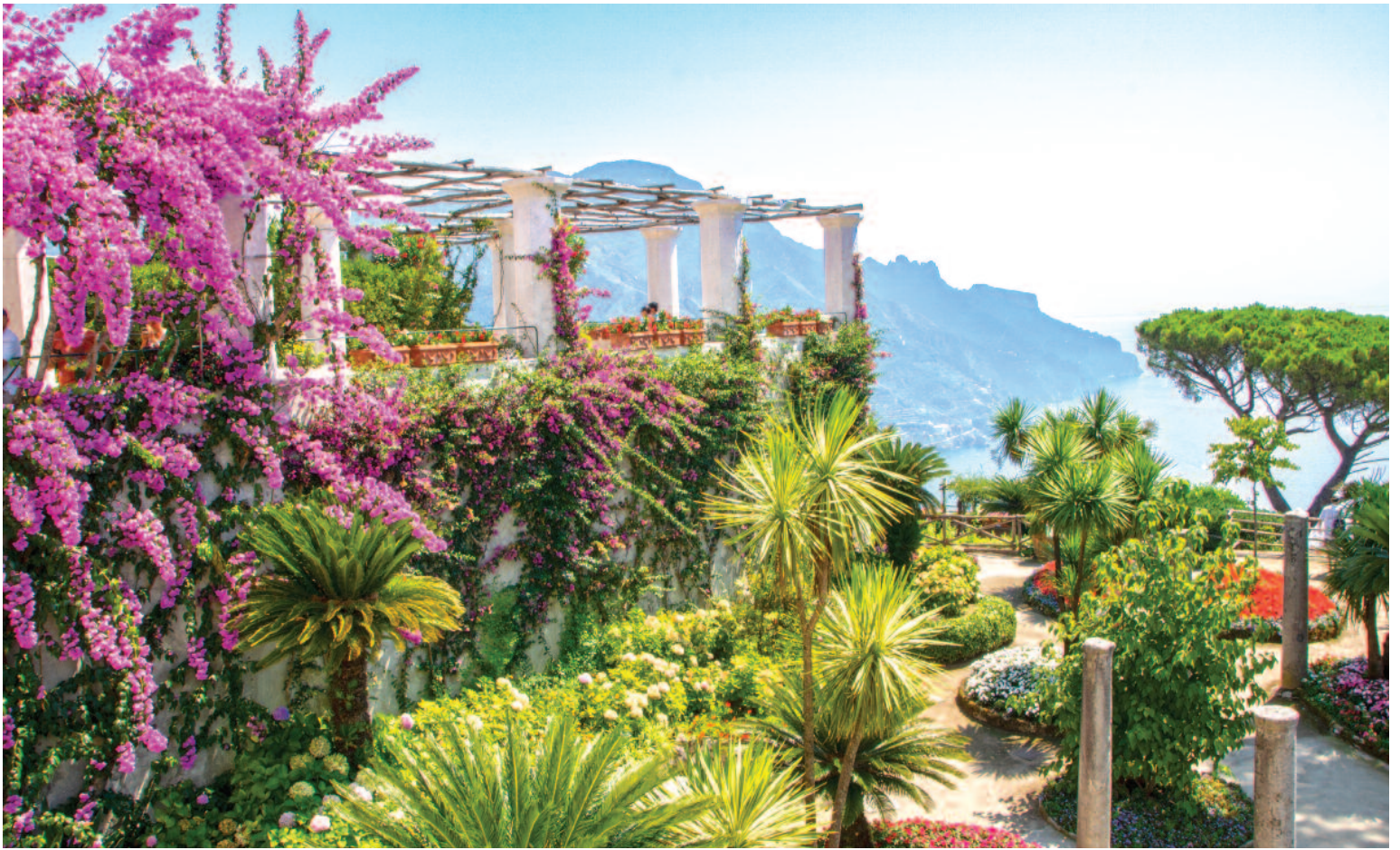
The beautiful colorful garden of Villa Rufolo, Ravello