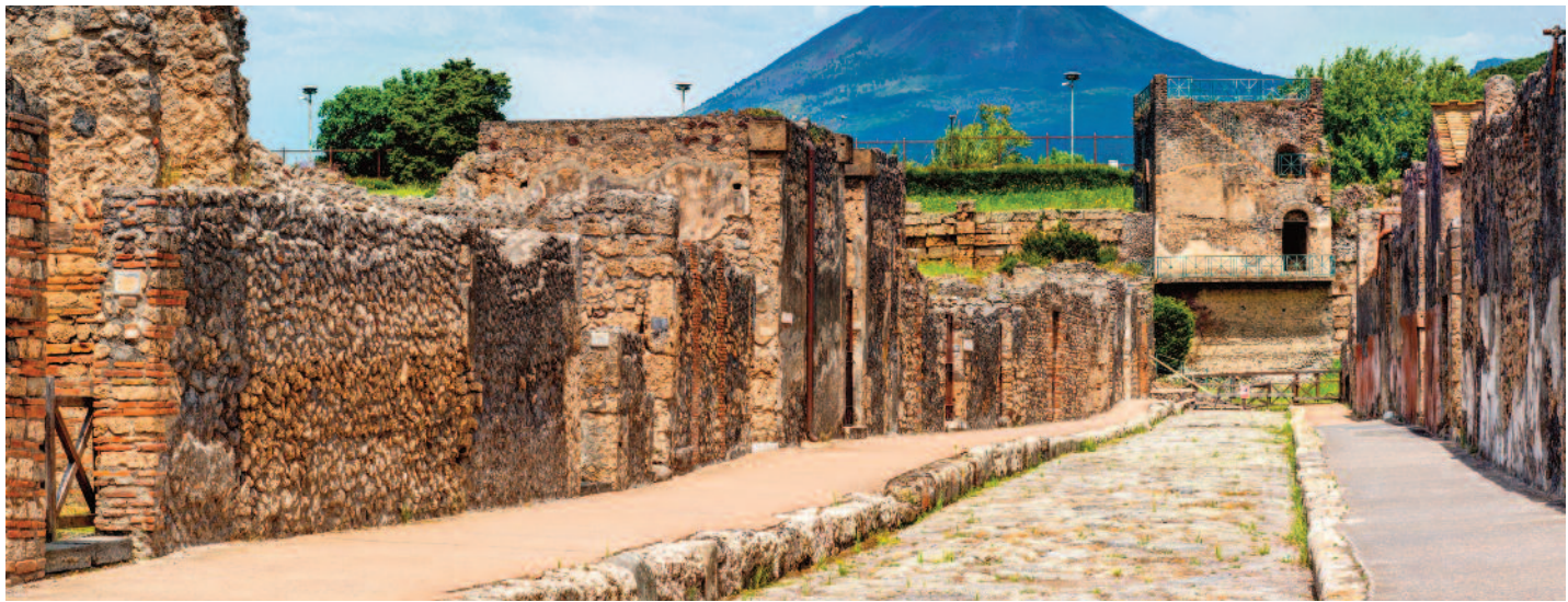
Street in Pompeii