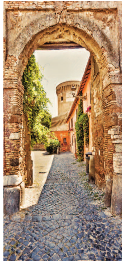
Gate to the medieval village of Ostia Antica

Spend the day exploring Herculaneum and Pompeii, the Roman towns that were destroyed by the cataclysmic eruption of Vesuvius in 79 AD. Situated near the coast and at the foot of