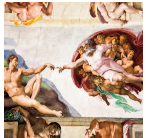
Creation of Adam by Michelangelo, Sistine Chapel, Rome

FOR RESERVATIONS AND INFORMATION, PLEASE CALL THALASSA JOURNEYS TOLL-FREE 866-633-3611