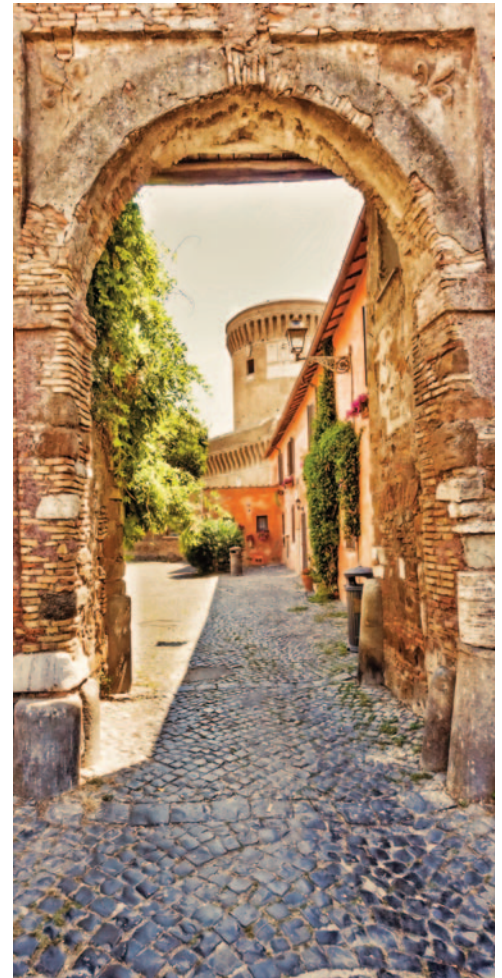
Gate to the medieval village of Ostia Antica

As we walk through the Vatican Museum we will