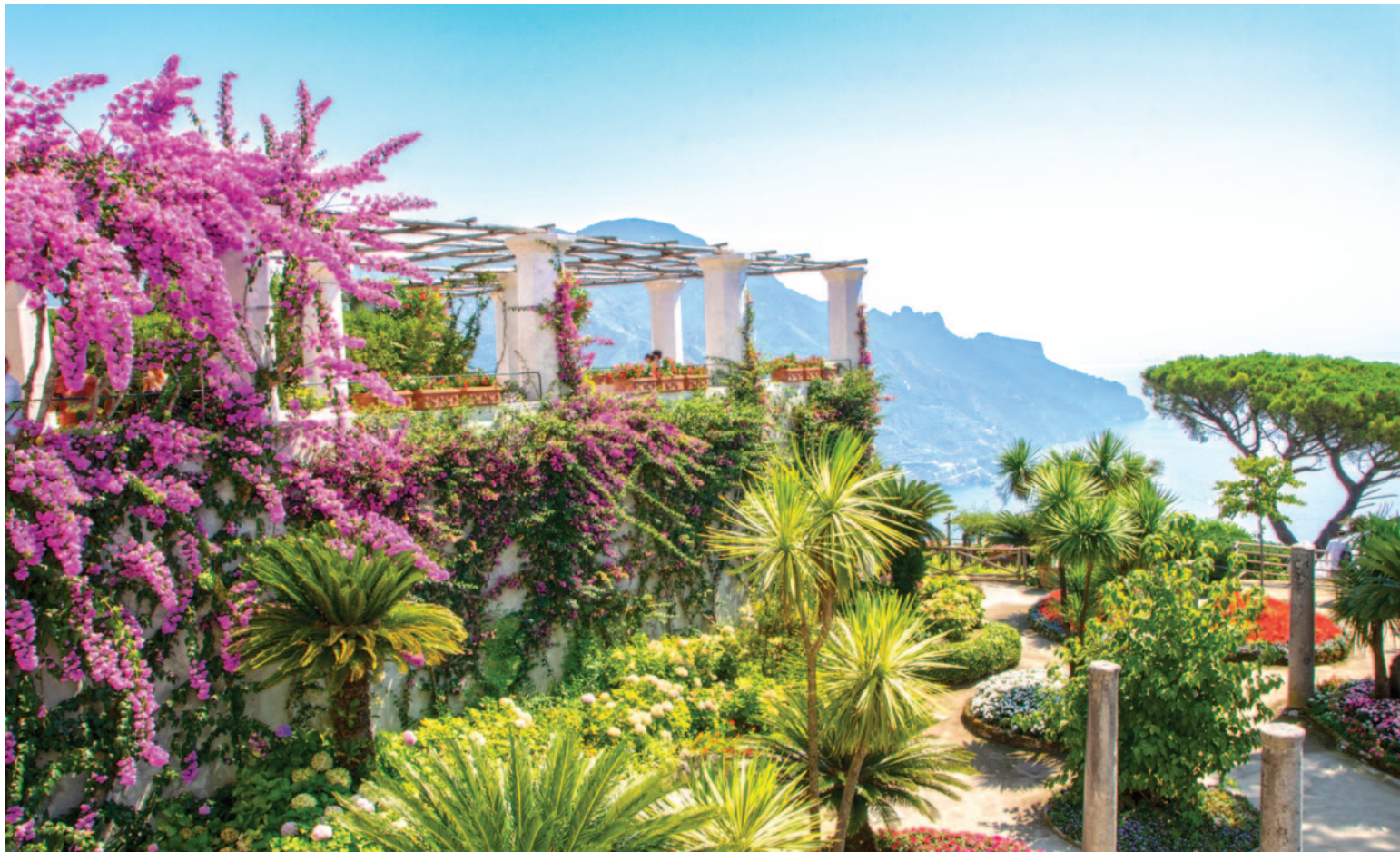
The beautiful colorful garden of Villa Rufolo, Ravello