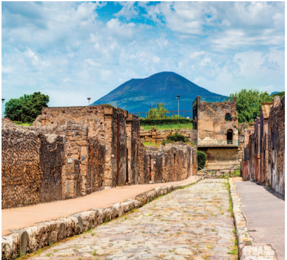
Street in Pompeii

NOT INCLUDED: Airfare, travel insurance, expenses of a personal nature; any meals and other items not mentioned in the itinerary and the Program Inclusions.