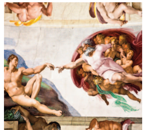
Creation of Adam by Michelangelo, Sistine Chapel, Rome

FOR RESERVATIONS AND INFORMATION, PLEASE CALL THALASSA JOURNEYS TOLL-FREE 866-633-3611