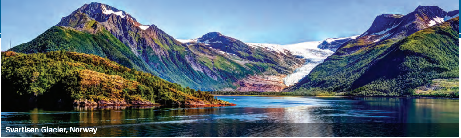
Svartisen Glacier, Norway

nearby Ringve Museum of Musical History, which tells the story of the evolution of Norwegian music. (B,L,D)