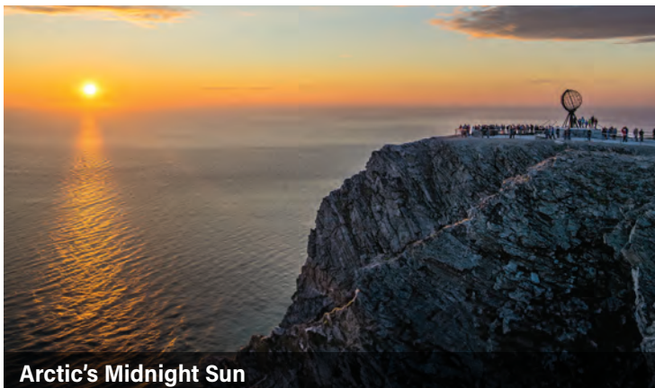
Arctic's Midnight Sun

After breakfast at the hotel, transfer to the Copenhagen International Airport for flights homeward.