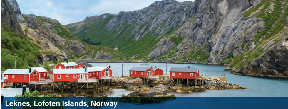
Leknes, Lofoten Islands, Norway

Travelers can expect an estimated total of 2-3 hours of walking per day. Nature and town excursions may involve walking on inclined or uneven surfaces such as rocky or slippery trails, unpaved paths, cobblestones, or stairs without handrails. During some site visits guests may need to stand briefly if seating is not available. Expedition excursions use motorized Zodiac boats, which can require taking a few big steps on a moving craft with crewmember assistance. Embarking and disembarking from motor coaches will also be necessary. Weather conditions in Norway can vary widely so a spirit of adventure will help you get the most from this unforgettable experience.