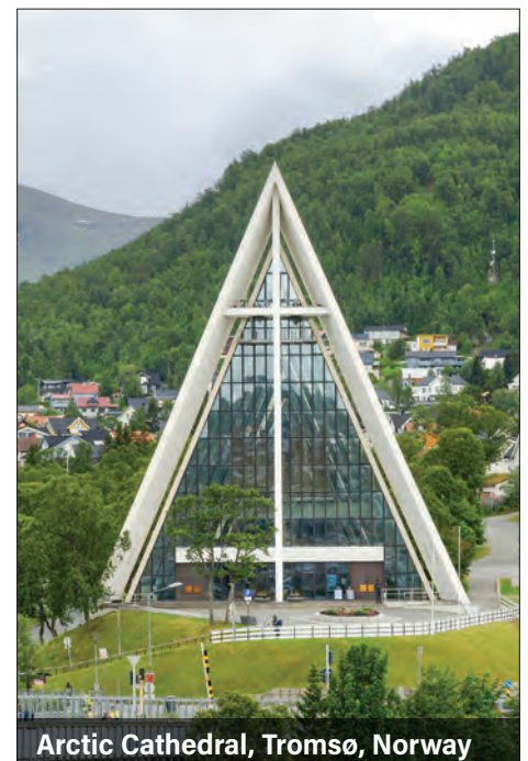
Arctic Cathedral, Tromsø, Norway