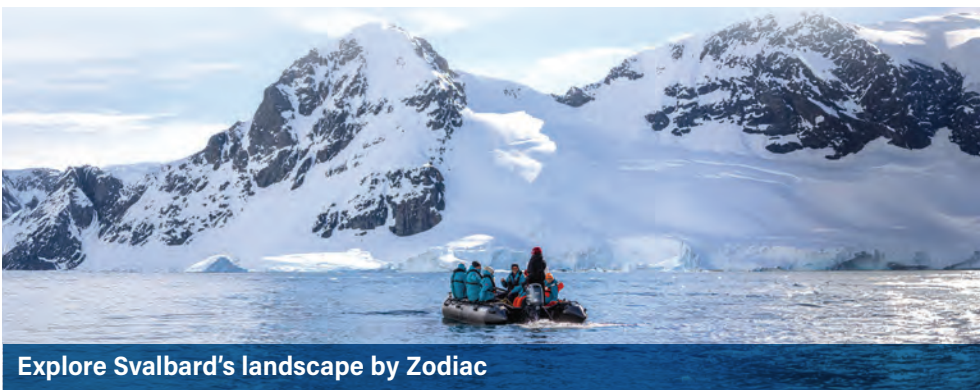
Explore Svalbard's landscape by Zodiac