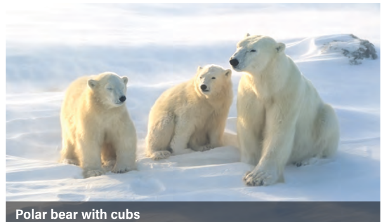
Polar bear with cubs