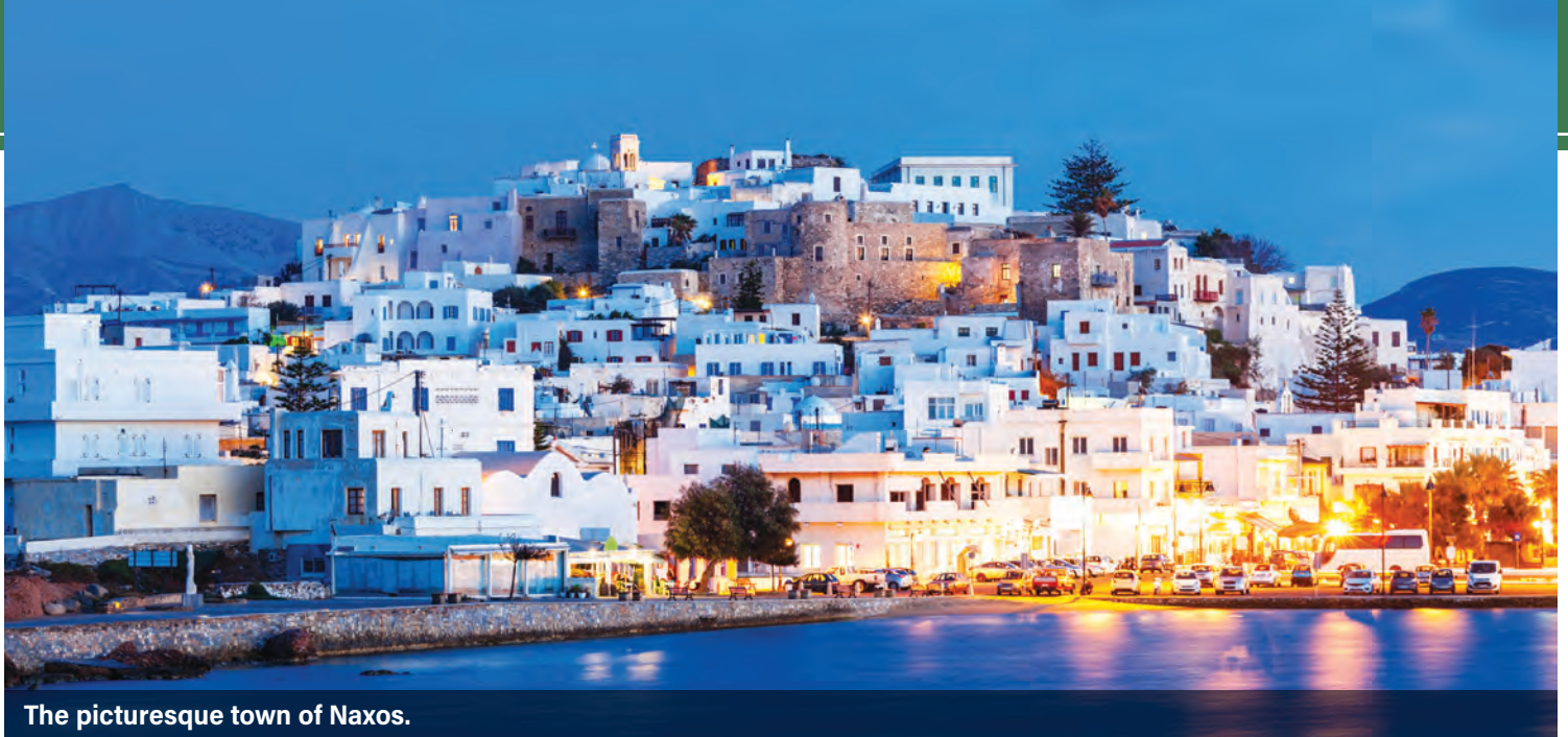
The picturesque town of Naxos.

attractive old villages, early Christian churches with painted interiors, and an active contemporary life that includes vibrant agriculture. The island was the birthplace of Dionysus, the god of wine, and the place where the Athenian prince Theseus abandoned Ariadne. Upon arrival, enjoy dinner and then check in at the Hotel Naxos Resort . (B, D)