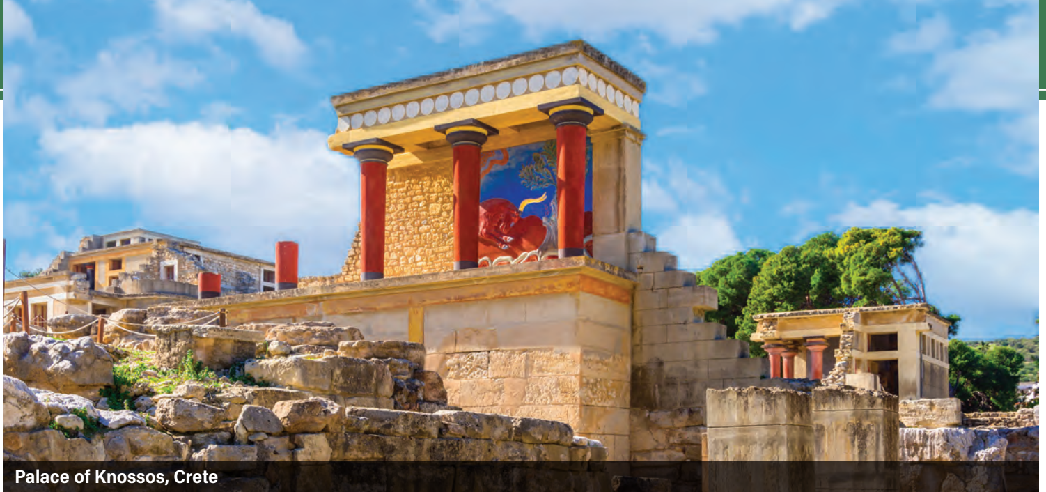
Palace of Knossos, Crete

diet, Crete is a magnificent place to visit and explore. Visit in the morning the Historical Museum of Crete, whose exhibits illustrate periods of the island's history; the Koules Fortress, dating from the 16th-century; and the church of St. Titos, which was built originally in the 9th century. Then wander through the market of the city, where stalls selling Crete's famed herbs can be found. After lunch, drive to Rethymno. Built between a commanding 15th-century fortress and the sea, Rethymno is one of Crete's most enchanting towns. (B, L)