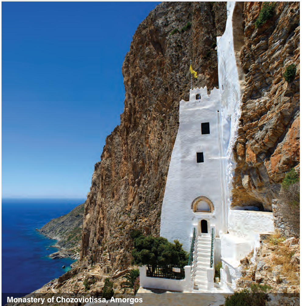
Monastery of Chozoviotissa, Amorgos

$1,290 per person, double occupancy Single room supplement: $230