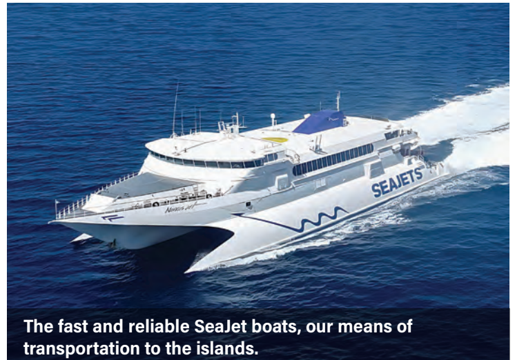
The fast and reliable SeaJet boats, our means of transportation to the islands.