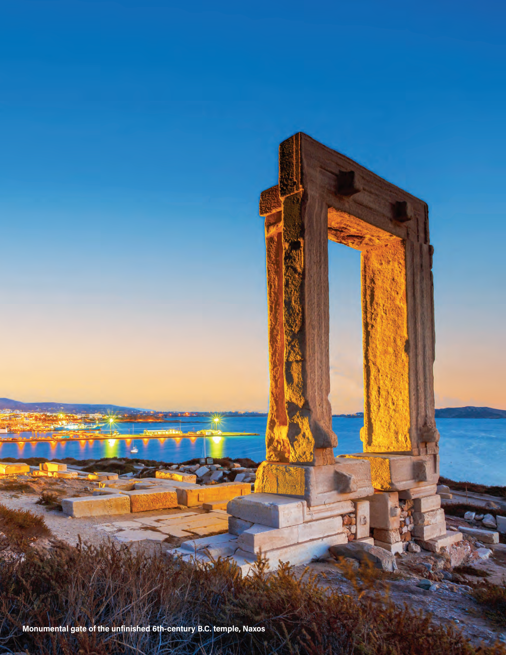
Monumental gate of the unfinished 6th-century B.C. temple, Naxos