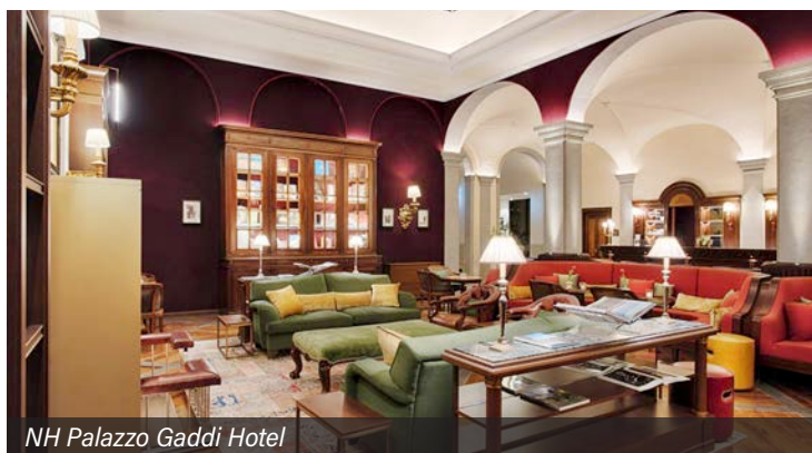
NH Palazzo Gaddi Hotel