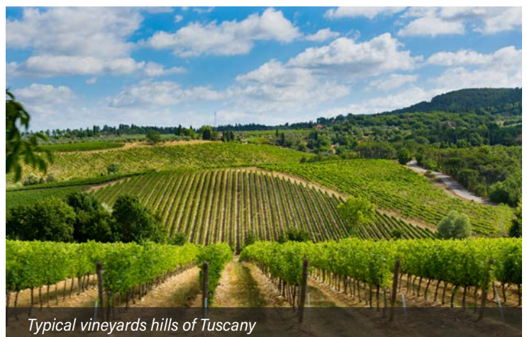
Typical vineyards hills of Tuscany