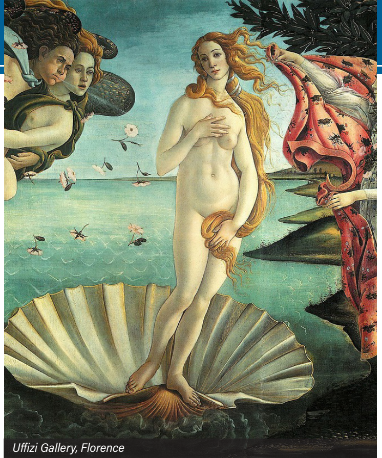
Uffizi Gallery, Florence

Visit this morning Palazzo Medici Riccardi, one of the finest examples of a Renaissance aristocratic palace in the city, with the Chapel of the Magi and its splendid fresco cycle. Continue on to the Istituto degli Innocenti: founded in the 15th century to