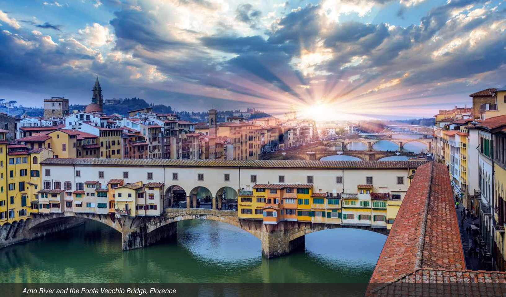
Arno River and the Ponte Vecchio Bridge, Florence