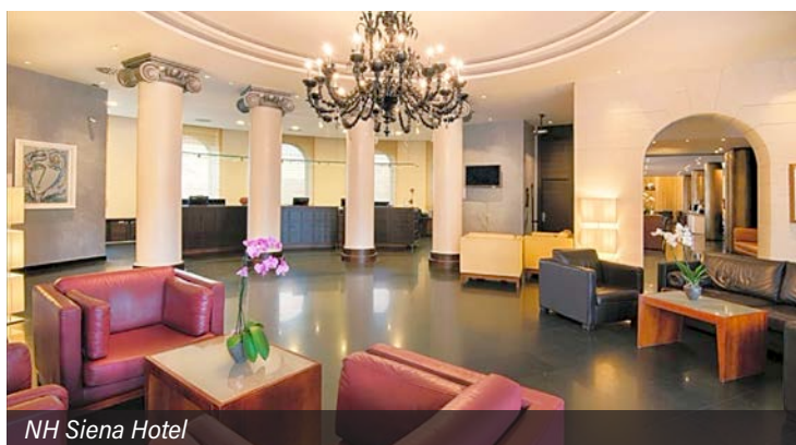
NH Siena Hotel

NOT INCLUDED: Airfare, travel insurance, expenses of a personal nature; any meals and other items not mentioned in the itinerary and the Program Inclusions.