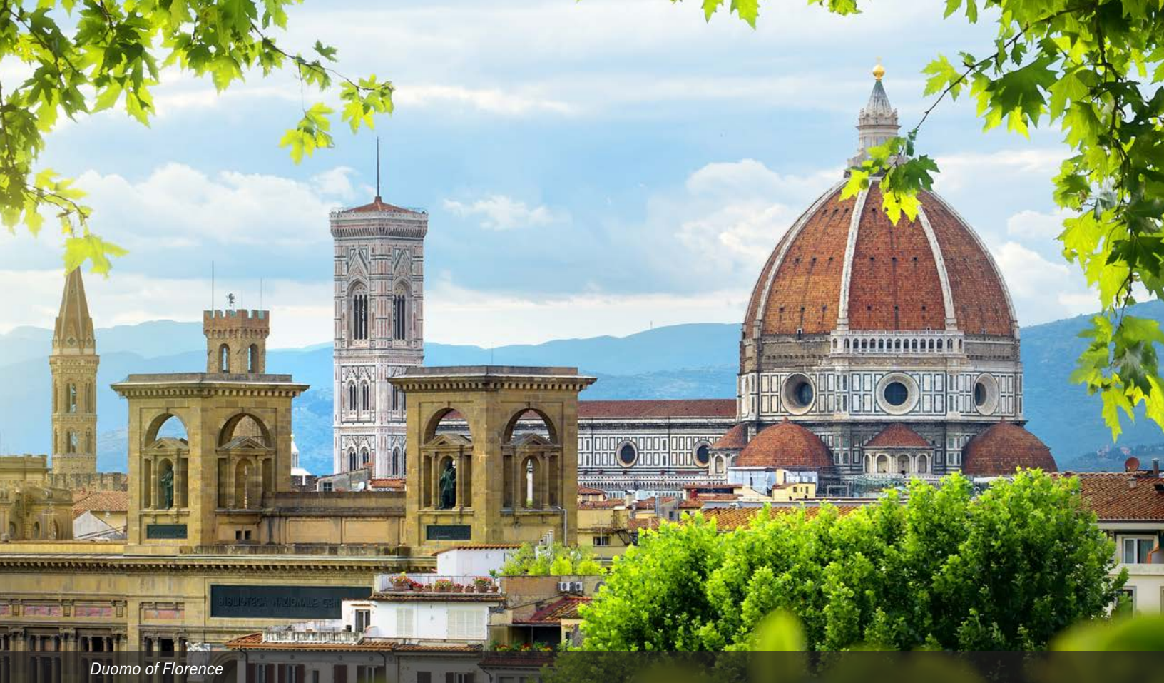
Duomo of Florence