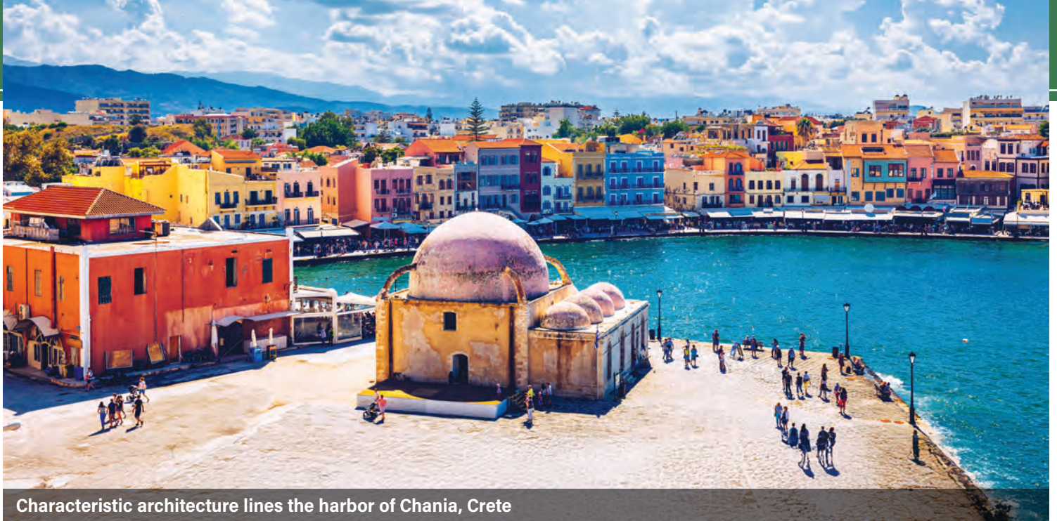
Characteristic architecture lines the harbor of Chania, Crete

of Yannoulis Chalepas, a native son, who became perhaps the most famous sculptor of modern Greece. (B, L)