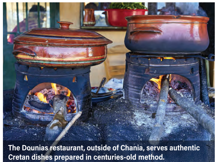
The Dounias restaurant, outside of Chania, serves authentic Cretan dishes prepared in centuries-old method.

Visit in the morning Antiparos ("opposite Paros"), a small pretty island, which is separated from Paros by a narrow channel. Just inland from the attractive waterfront is the island's main town, a walled settlement that dates from the 1440s, considered to be the finest of its kind in the Cycladic islands. Enjoy exploring this delightful