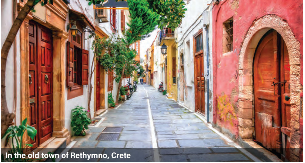
In the old town of Rethymno, Crete