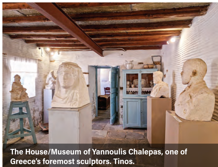
The House/Museum of Yannoulis Chalepas, one of Greece's foremost sculptors. Tinos.

Sail in the morning to Paros, one of the most quintessential Cycladic islands. Prosperous since antiquity as the source of some of the world's finest marble that was preferred by master sculptors from antiquity to more recent times, Paros was also the home of Archilochus, the great 7th-century BC lyric poet who was considered by the ancients as great as Homer. Upon arrival, tour Parikia, the island's beautiful main town, known for its typical architecture of white-wash cubic houses that line the narrow streets and alleyways. One of the most important Byzantine churches in Greece, Ekatonpiliiani, is located here. Dating originally to the 4th century, Ekatonpiliiani has been a place of worship for over 1,700 years. The Archaeological Museum houses a fine collection of artifacts excavated at ancient sites of Paros and nearby islands. Hotel Agnanti . (B, L, D)