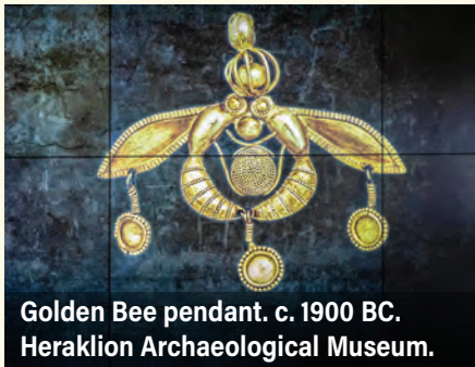
Golden Bee pendant. c. 1900 BC. Heraklion Archaeological Museum.

NOT INCLUDED: Airfare, travel insurance, items and expenses of a personal nature, and any items not mentioned in the Itinerary and Program Inclusions.