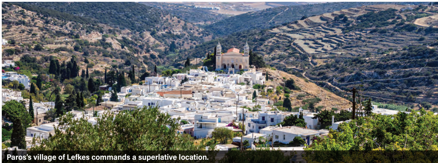
Paros's village of Lefkes commands a superlative location.

Spend the day exploring Tinos's interior and its attractive old villages, including Ktikados, built on the side of a valley; Kambos, sited on top of a hill, where we will visit the Costas Tsoklis Museum, home to art by the notable Greek artist; Kardiani, perched on a cliff and whose narrow alleyways afford superb views of the sea; and enchanting Pyrgos, with its beautiful square lined with cafés and tavernas. Since antiquity, it has been the center of the quarrying, cutting and carving of marble. Here, we will visit the Museum House