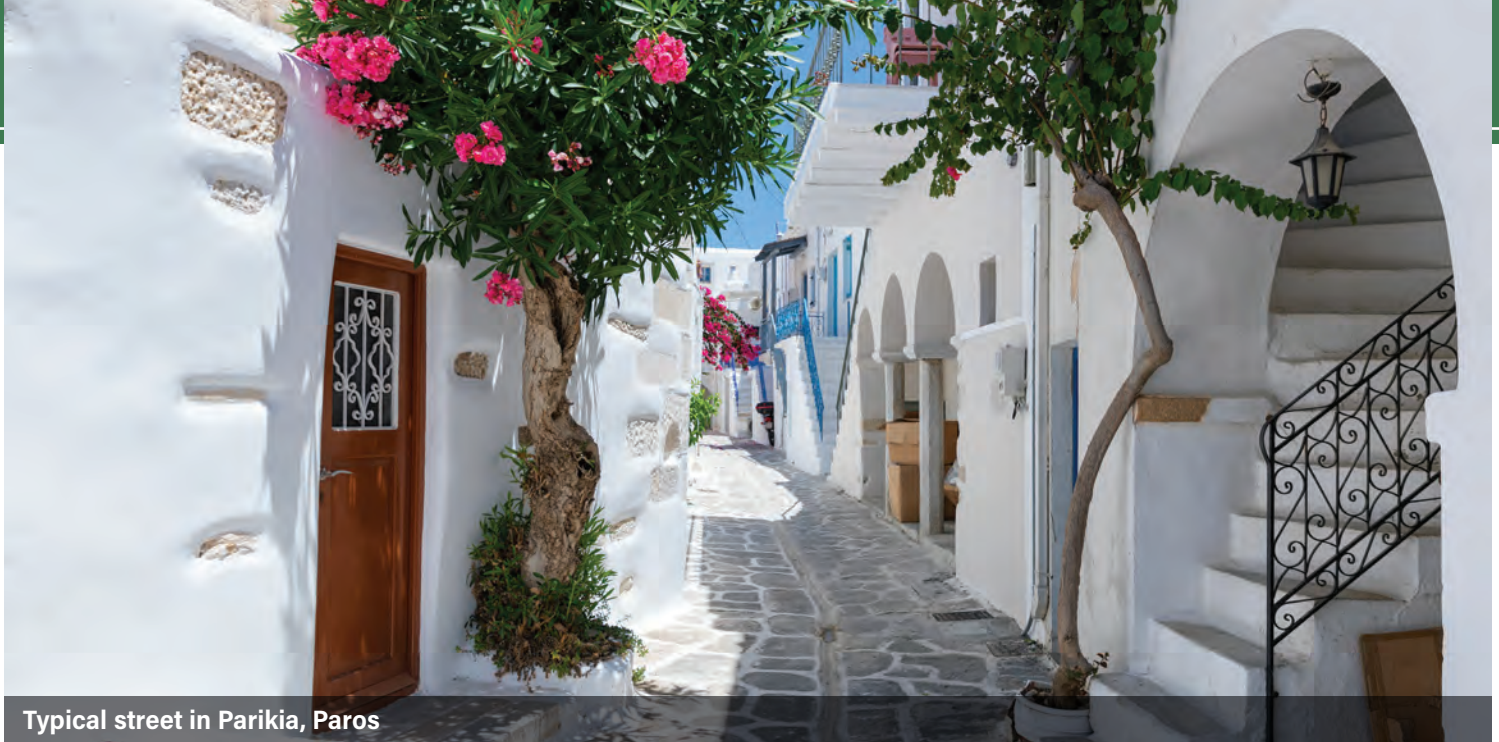
Typical street in Parikia, Paros

place before returning to Paros for an afternoon at leisure. (B, L)