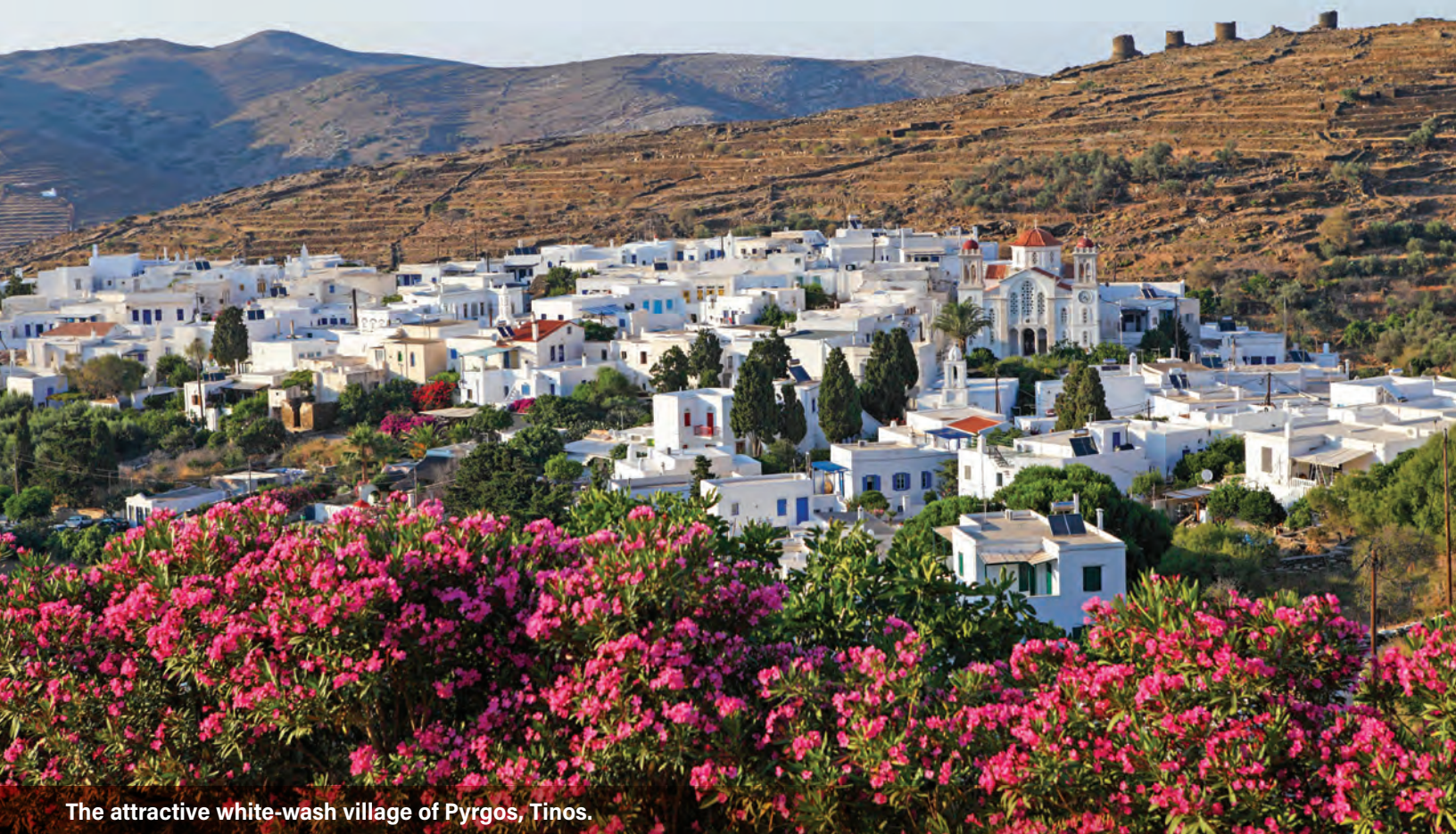
The attractive white-wash village of Pyrgos, Tinos.