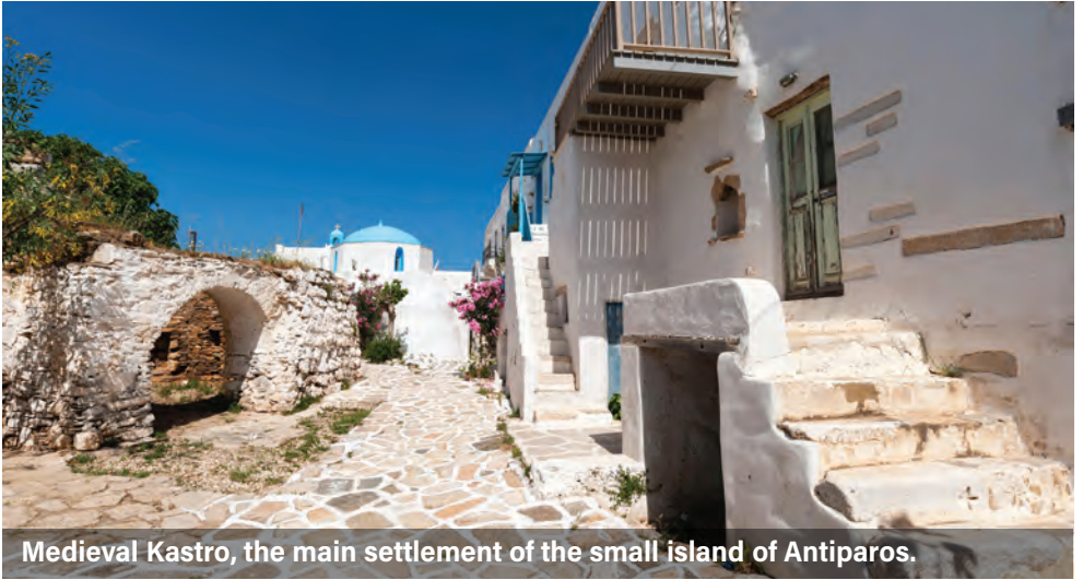
Medieval Kastro, the main settlement of the small island of Antiparos.