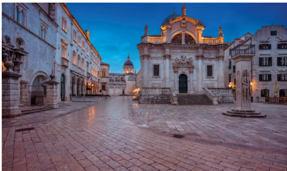
Dubrovnik's historic architecture

Roman, Byzantine, Hungarian and Venetian. Many intact buildings survive from the 13th – 15th centuries, including the splendid cathedral of Saint Lawrence, the Venetian Loggia, and the Cippico Palace, as well as several houses in Gothic and Renaissance styles. On the way back to Split, we will visit the Mestrovic Gallery, the villa of Ivan Mestrovic, Croatia's premier sculptor. Sited beautifully by the sea, the villa contains a permanent collection of his work. Spend the afternoon at leisure to enjoy and explore Split on your own.