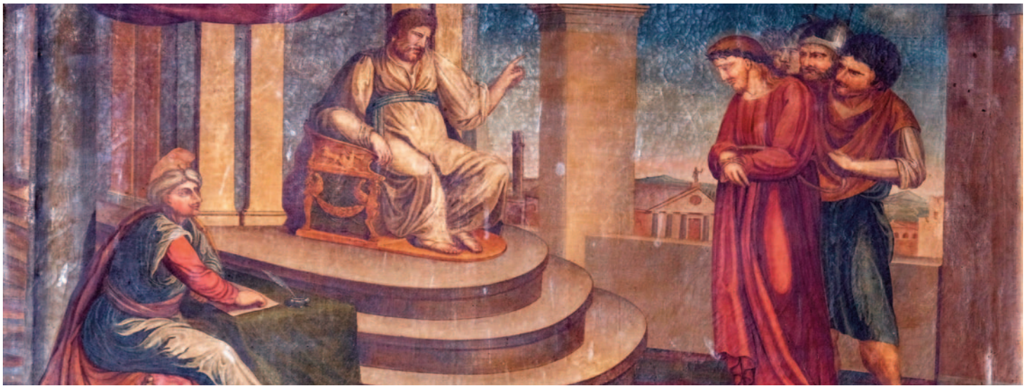
Fresco in the Franciscan Church, Dubrovnik