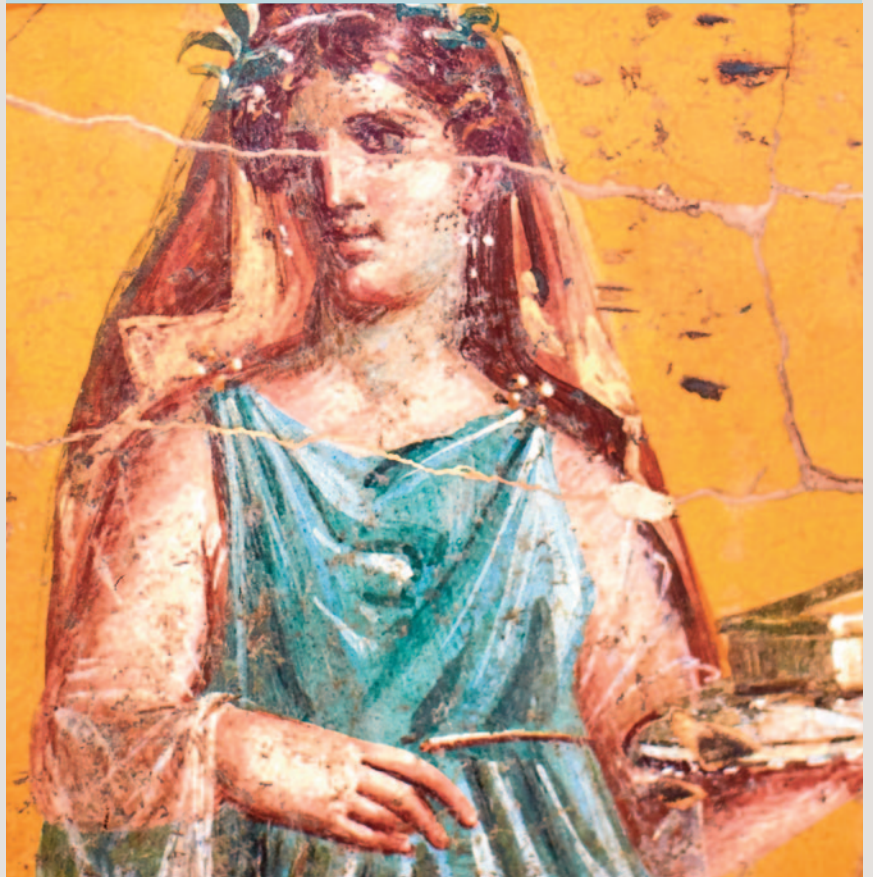
Fresco Painting, Pompeii