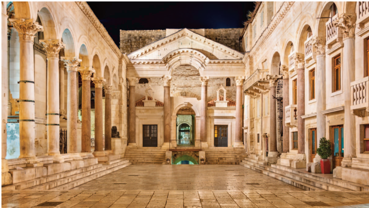
The Palace of Diocletian, Split