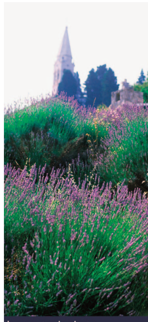
Hvar is known for its lavender fields

Drive in the morning to Trogir. A UNESCO World Heritage Site, Trogir is built on a small island connected to the mainland by a bridge. Within its walls is one of the most beautiful and well-preserved medieval towns along Croatia's Dalmatian coast. Settled originally by Greeks in the 4th century BC, it subsequently became