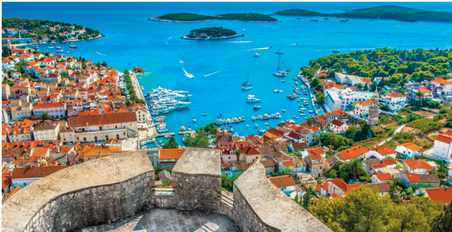
Hvar and its nearby islets