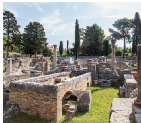
Roman ruins of Salona