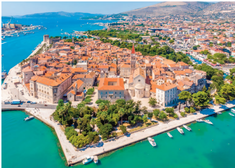
The well-preserved medieval town of Trogir