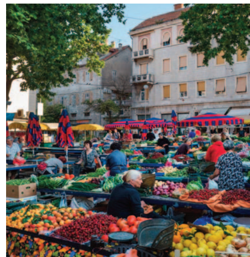
Green Market in Split

FOR RESERVATIONS AND INFORMATION, PLEASE CALL THALASSA JOURNEYS TOLL-FREE 866-633-3611