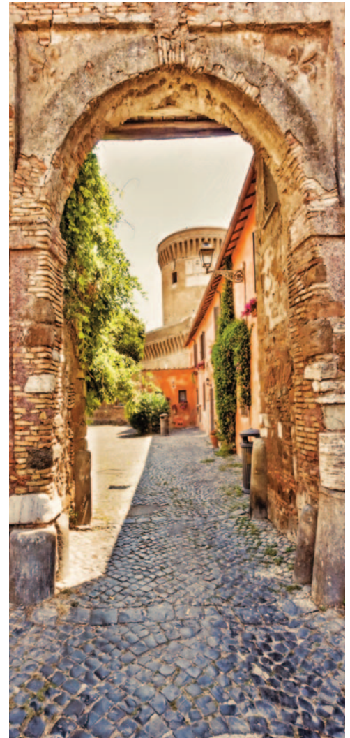
Gate to the medieval village of Ostia Antica

This morning, we will explore Vatican City, with a special early morning entrance to the Sistine Chapel to view Michelangelo's Genesis ceiling frescoes and his Last Judgement altar fresco. As we walk through the Vatican Museum we will view the pontifical collection of classical sculptures at Pio Clementino; Gallery of the Tapestries; Gallery of the Geographical Maps;