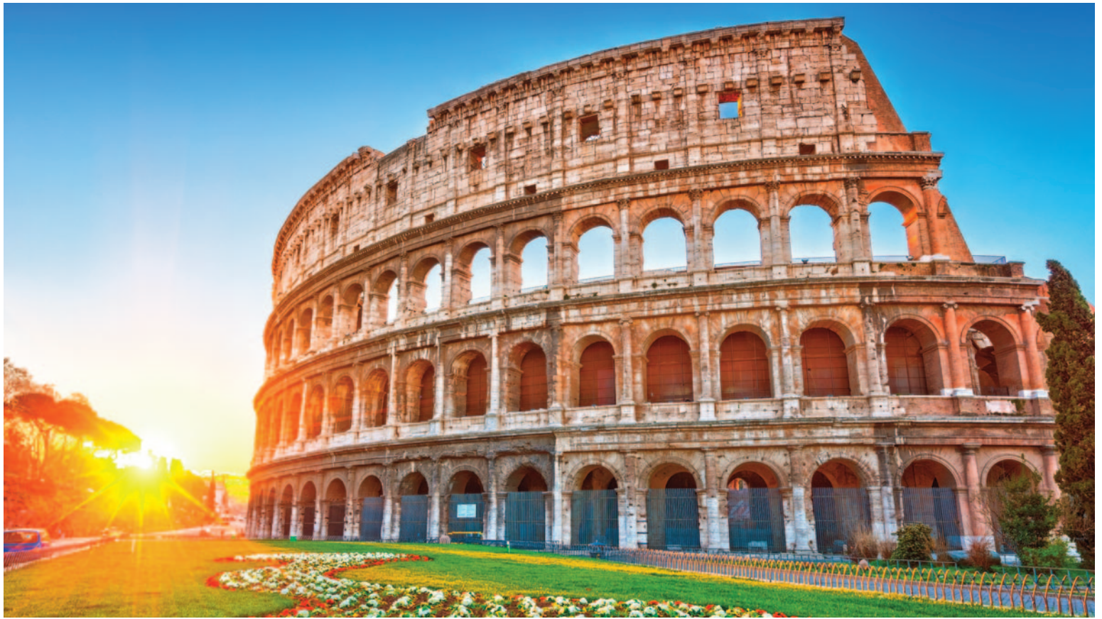
Colosseum in Rome

grand villas, terraced vineyards, and cliffside lemon groves. Stop at the beautiful town of Amalfi, an old-maritime republic that competed with Venice and Genoa for control of the Mediterranean trade routes. Visit the 9th-century cathedral of St. Andrew and its 13th-century cloister, and the Civic Museum. After lunch, continue to Ravello, one of Italy's most attractive hill towns, where we visit the Palazzo Rufolo, dating to the 11th century, and its beautiful gardens.