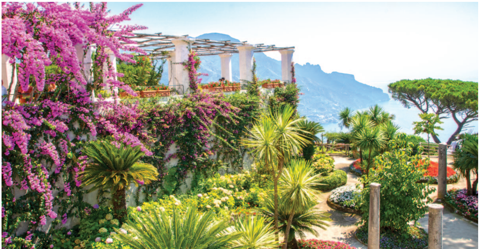
The beautiful colorful garden of Villa Rufolo, Ravello