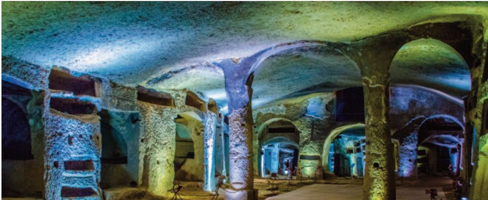
Catacombs of Saint Gennaro, Naples