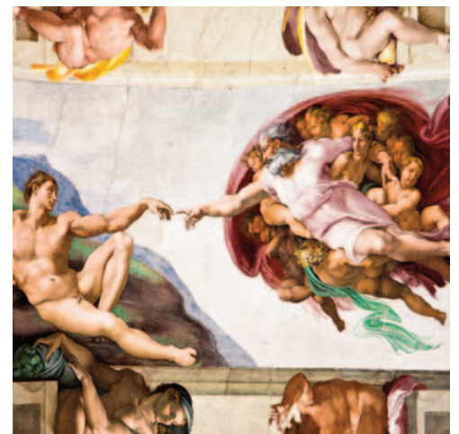
Creation of Adam by Michelangelo, Sistine Chapel, Rome

FOR RESERVATIONS AND INFORMATION, PLEASE CALL THALASSA JOURNEYS TOLL-FREE 866-633-3611