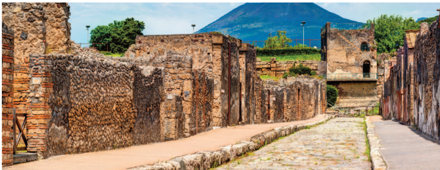
Street in Pompeii