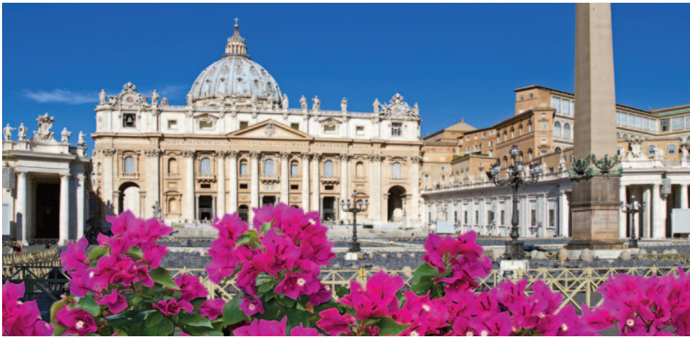
St. Peter's basilica in Vatican, Rome